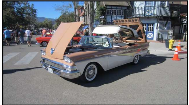
What, another Ford?