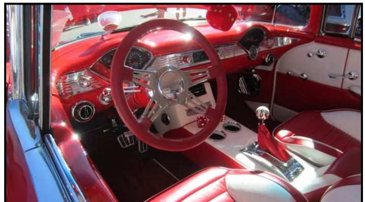
Custom Corvette interior.