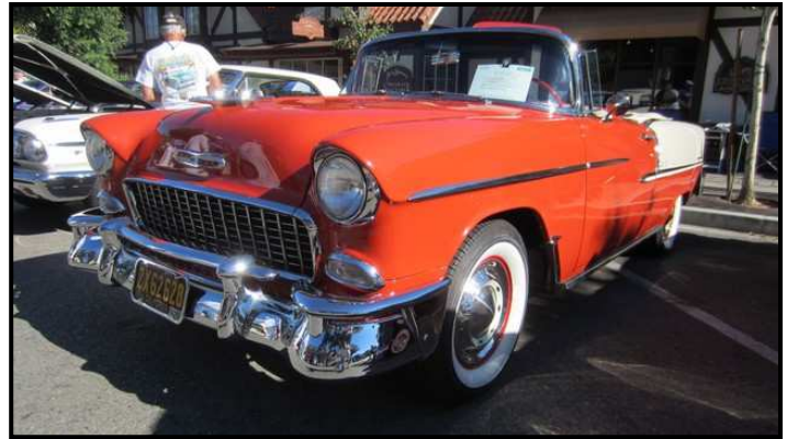
What, another Chevy?