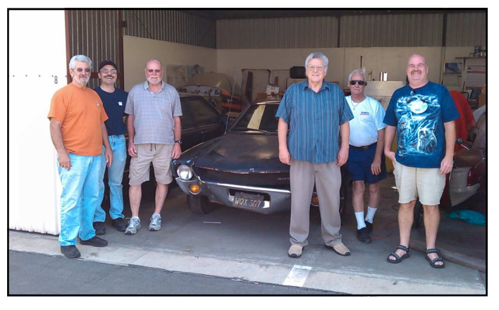
Playmate AMX security team!