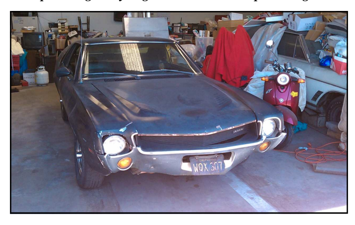
Probably the first time the car has seen a garage in its life!