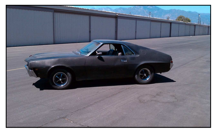
Rip roaring ready to go someone. Next trip Las Vegas?