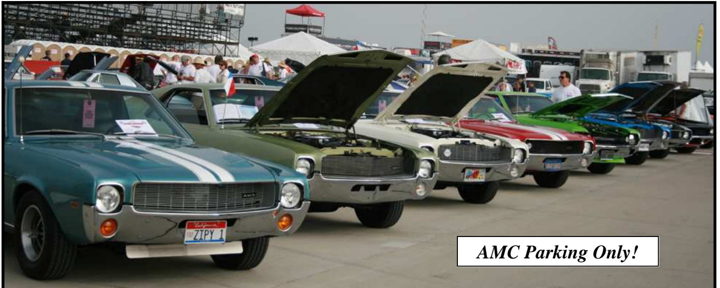
AMC Parking Only!