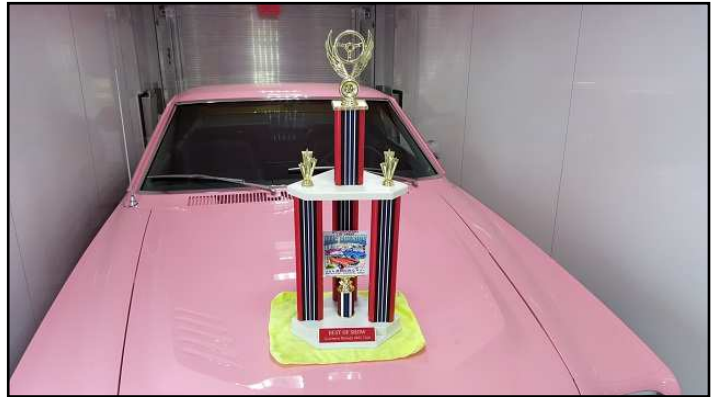
The Best Of Show Trophy