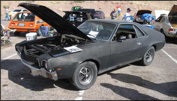
Playmate AMX article now available in January 2016 Muscle Car Review

Well the pink Playmate AMX has come full circle. Shortly after buying it in July 2010 I brought it to the Las Vegas AMC Show that year as is, before the restoration began. It was still as the day I first saw and bought it. Five years later it was back at the 2015 Las Vegas AMC Show, fully restored, winning Best of Show at the awards presentation.