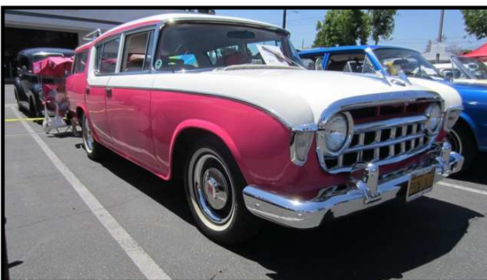
Pretty In Pink!