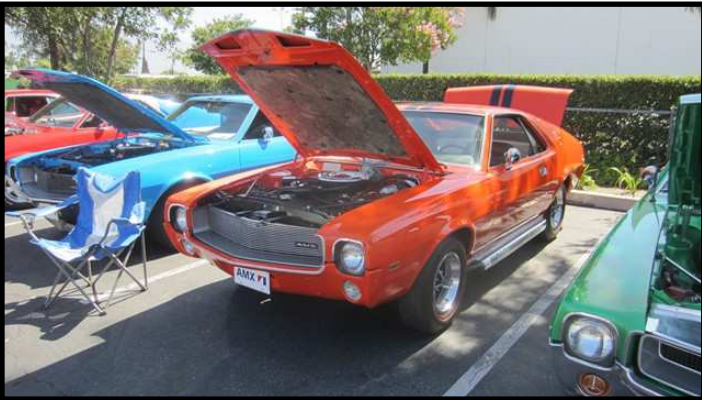
Jay Baker's 69 Big Bad Orange AMX