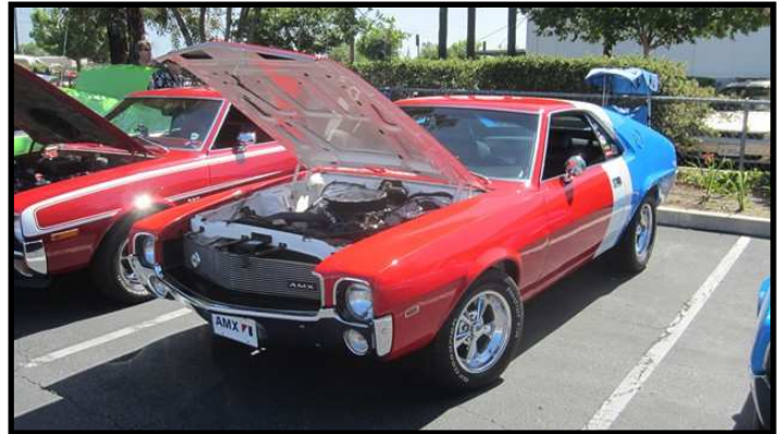
Allen Tyler's 68 AMX/Best Of Show