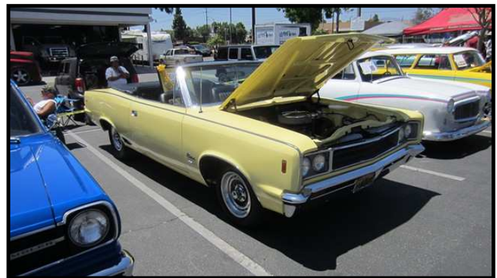
Nacho Chavez's 68 Rebel Convertible