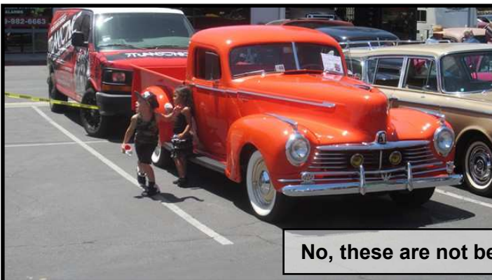
Lance Baroldi's 46 Hudson pickup.