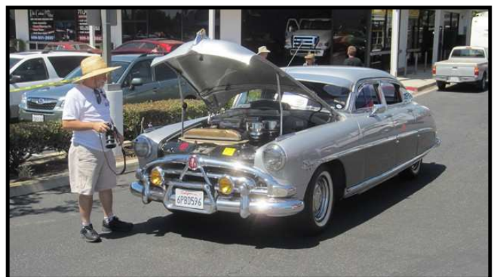
1952 Hudson Hornet