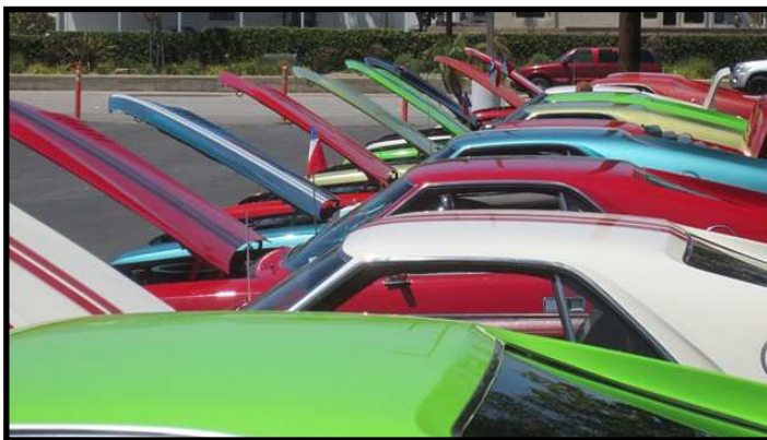
Lots of AMXs