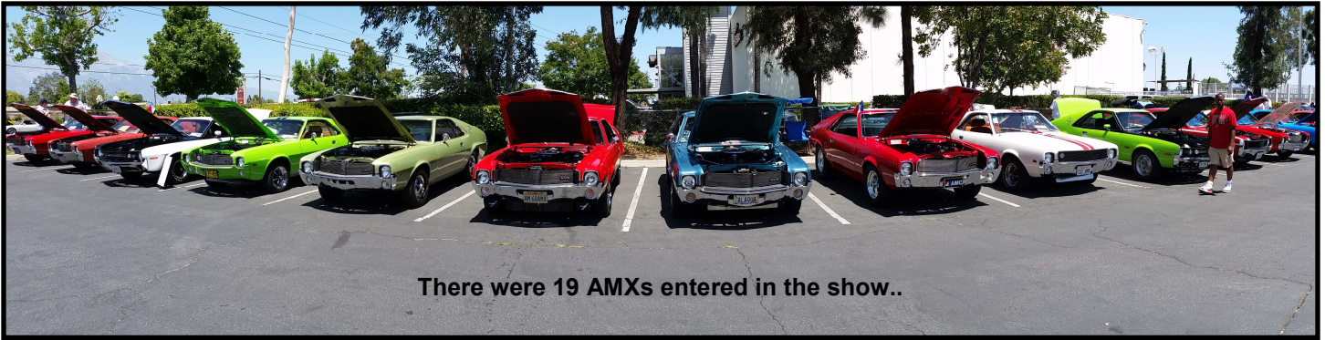
There were 19 AMXs entered in the show..