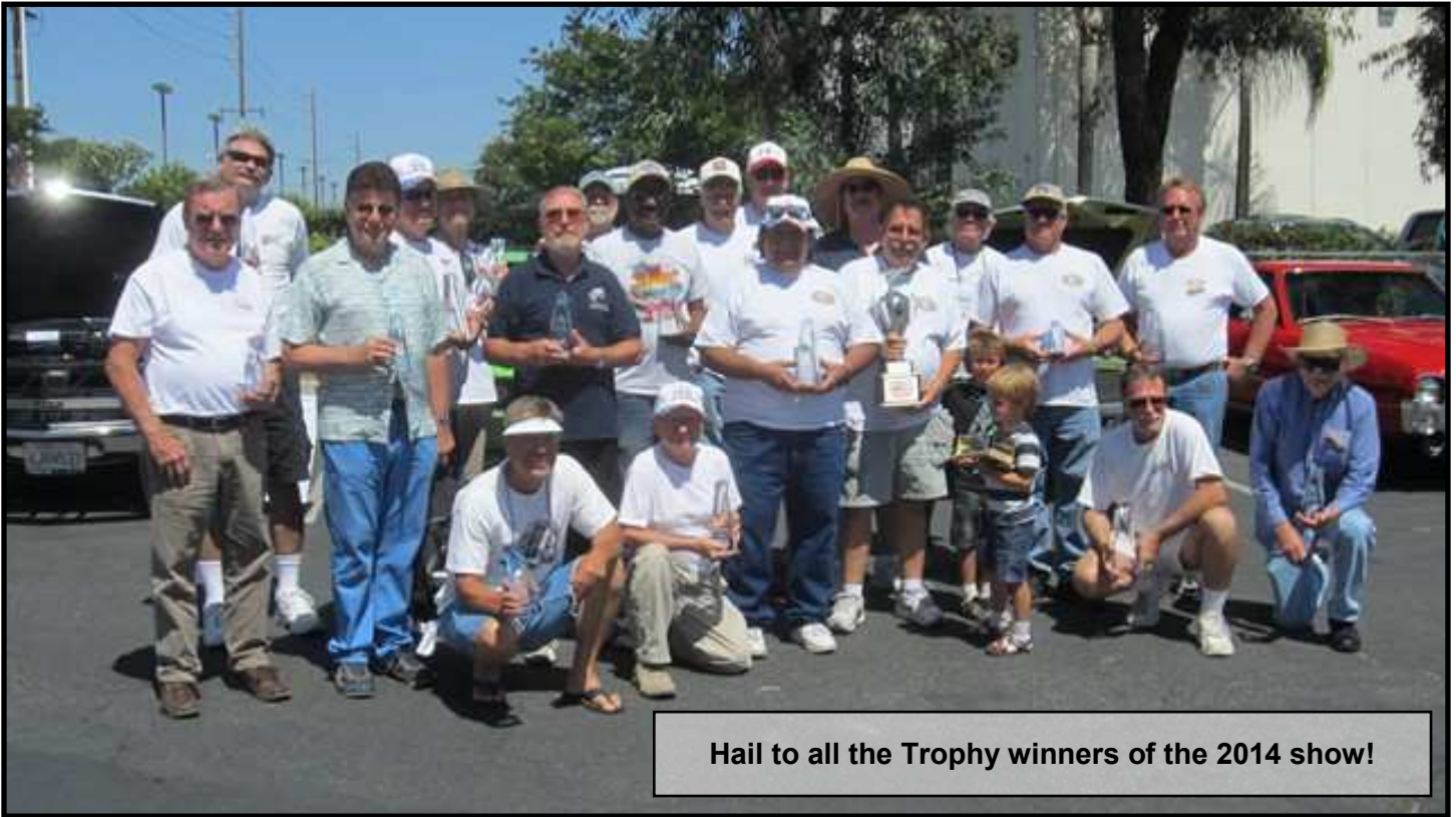
Hail to all the Trophy winners of the 2014 show!