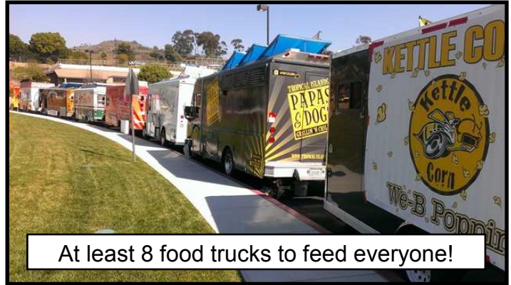
At least 8 food trucks to feed everyone!