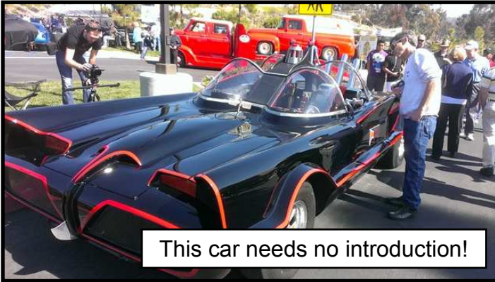
This car needs no introduction!