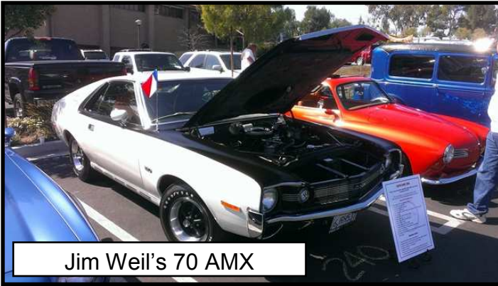
Jim Weil's 70 AMX