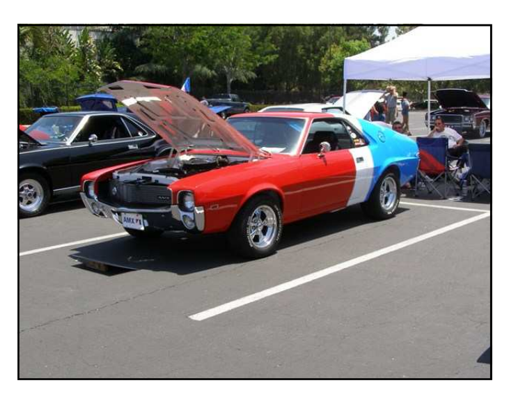
Allen Tyler's 68 AMX Best of Show