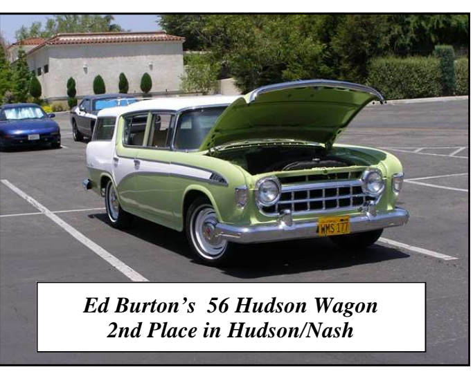
More photos of the car show on the following pages..