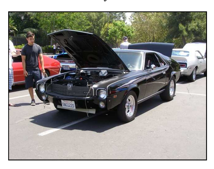
Earl Conkling's 69 AMX