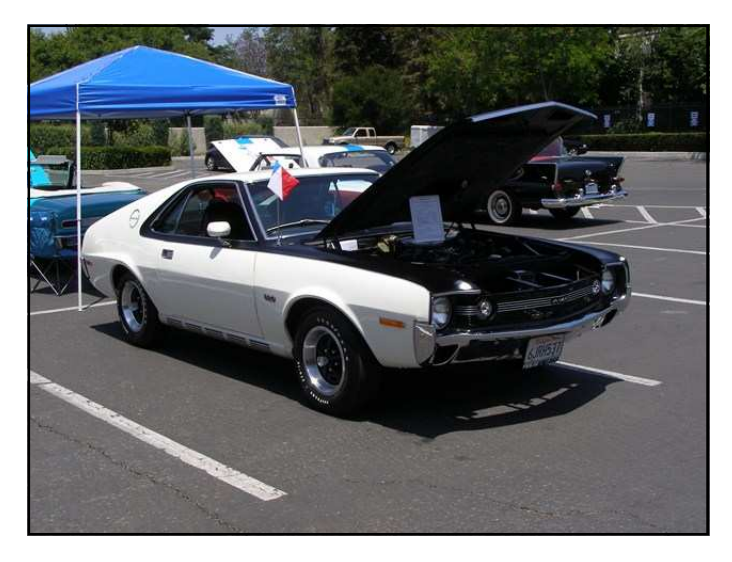
Jim Weil's 70 AMX 1st Place in AMX Stock