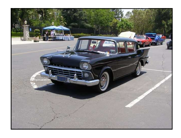
Pat Butler's 58 Rambler Deluxe