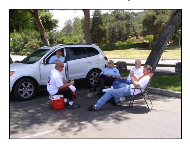
The Vegas guys hanging out in the shade