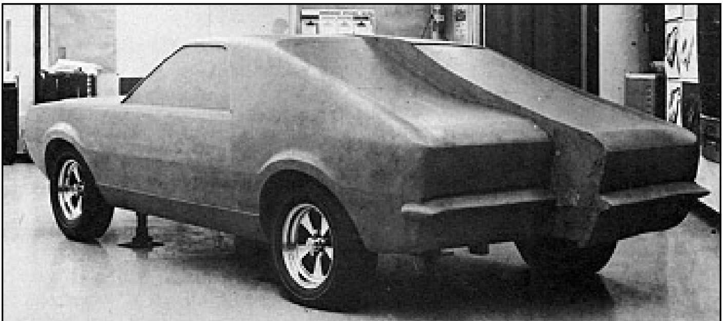
The AMX and Javelin cut in half to show their body differences..