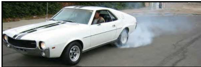
Steve Fox burning rubber?