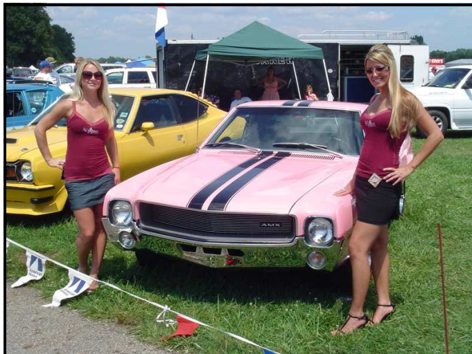
Don't know their names, but they're invited to our car show!