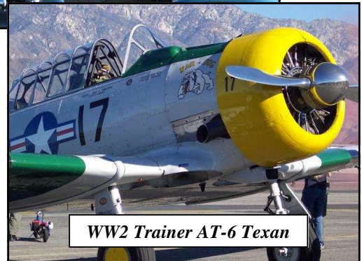
WW2 Trainer AT-6 Texan