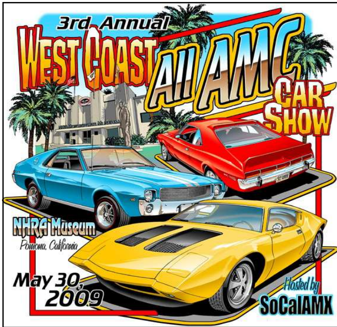
2009 T-shirt Logo!

The car show this year should be the biggest yet!