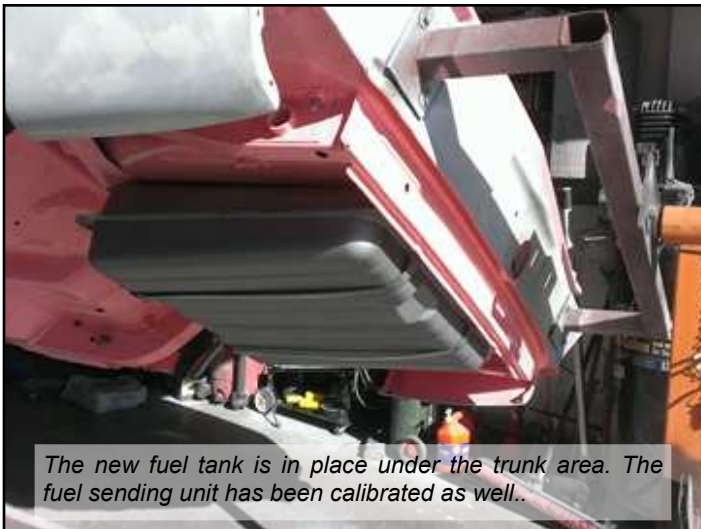
The new fuel tank is in place under the trunk area. The fuel sending unit has been calibrated as well..