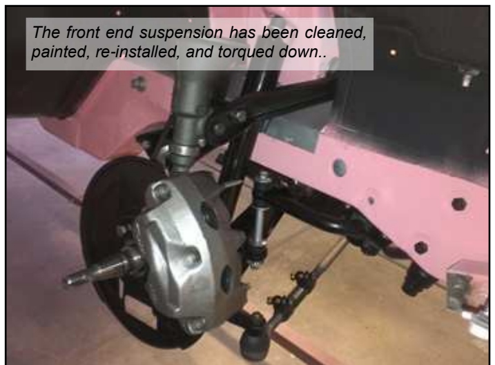
The front end suspension has been cleaned, painted, re-installed, and torqued down..