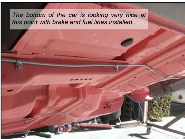
The bottom of the car is looking very nice at this point with brake and fuel lines installed..