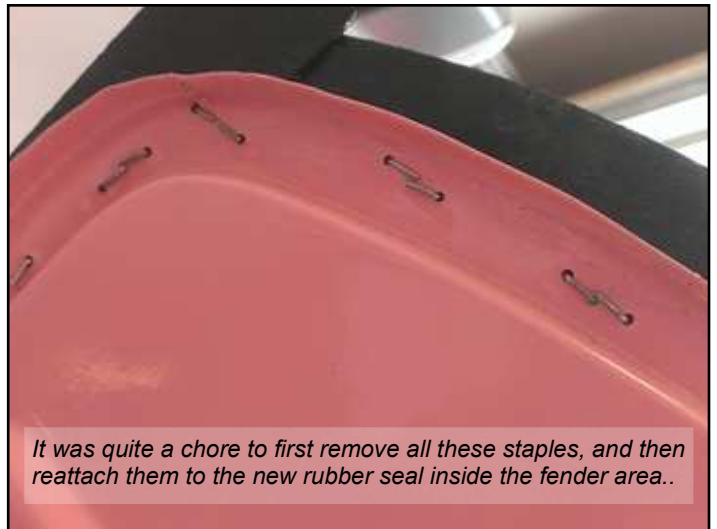
It was quite a chore to first remove all these staples, and then reattach them to the new rubber seal inside the fender area..