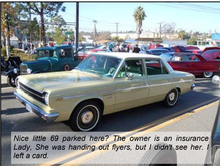
Nice little 69 parked here? The owner is an insurance Lady, She was handing out flyers, but I didn't see her. I left a card.