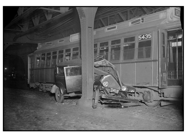
This car came out a loser in a battle of wills with a trolley bus on Boston's South End in 1932.