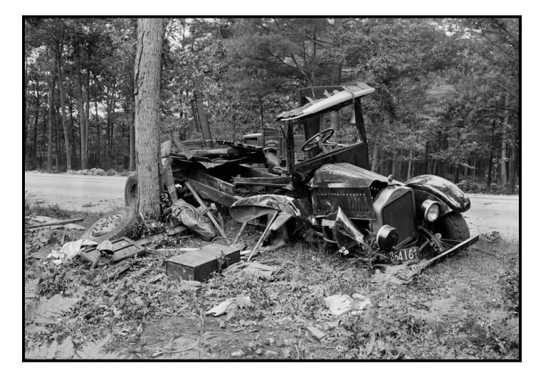
This truck stood no chance when it came into contact with a tree on a rural Mass. road, disintegrating on impact - leaving just the steering wheel intact.