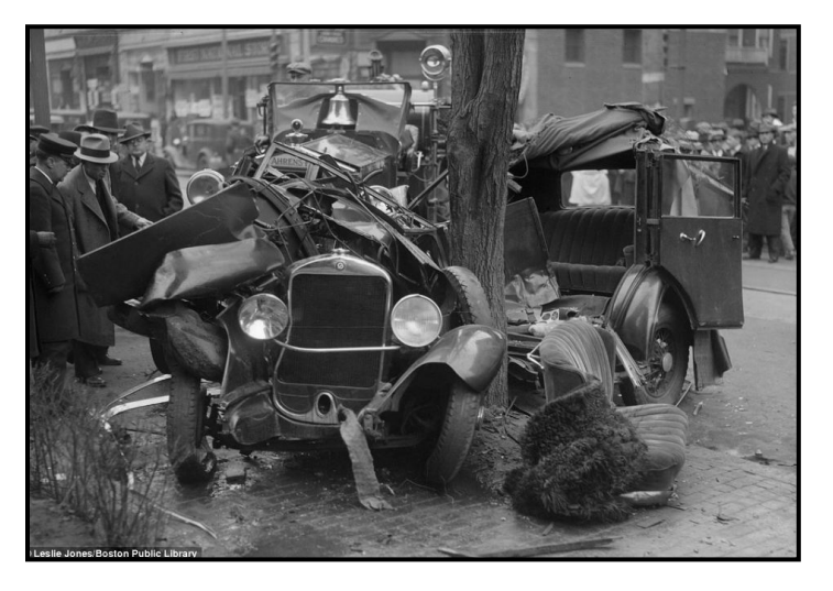
Officers examine a car that has wrapped itself around a tree, spilling its interiors onto the street in Boston in 1933.

Add in the fact drivers didn't need to pass a test before they got behind the wheel, and it's easy to see why accidents were frequent and often spectacular.