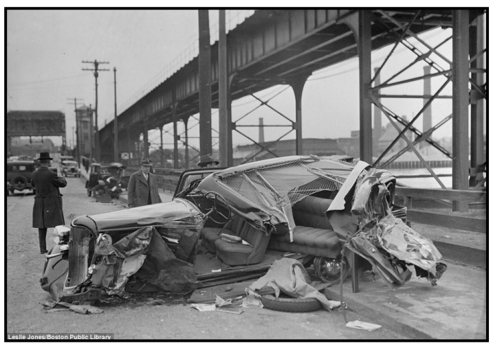
The scene of an accident in 1935. Information with the photo reveals a car stolen by joyriding children crashed into a lawyer's car, killing him.