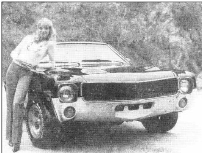
Victoria's Vetri and her Playmate AMX in 1983.

Victoria Vetri wants to thank the National Club for making her a lifetime honorary member. She plans to become active in the Southern California AMX Chapter too!