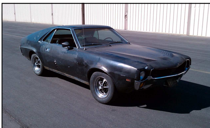
The Playmate AMX today..