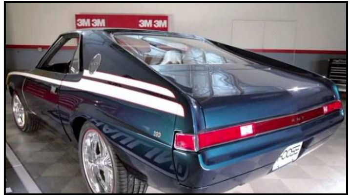
John's 1969 AMX after its Overhauled.