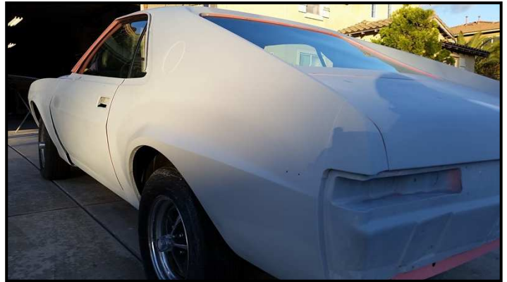
Block Sanded: Ready to paint?