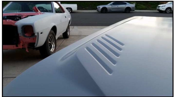
The hood will get a lot of scrutiny before a coat of paint.