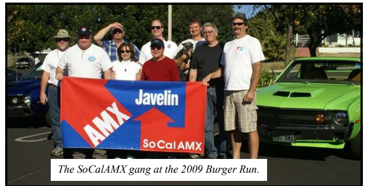
The SoCalAMX gang at the 2009 Burger Run.

This is a great show, attended yearly by members of SoCalAMX. Normally we have between 5-10 AMCs there. Only $10 gets you in and includes a t-shirt.