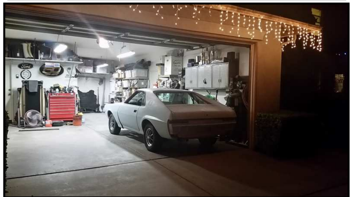
Xmas lights for the Playmate AMX