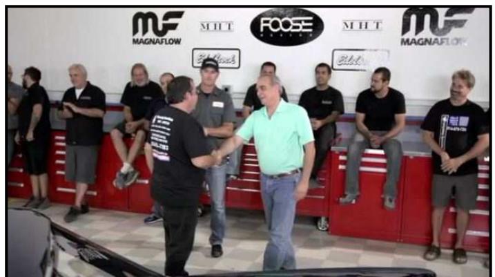
End of the show. A Thank You to everyone!