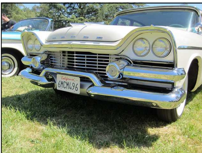
It almost looks like the front end is going to try and talk to you. Maybe not?