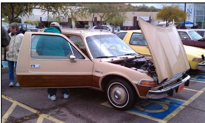
Wayne's World Classic—The Pacer!