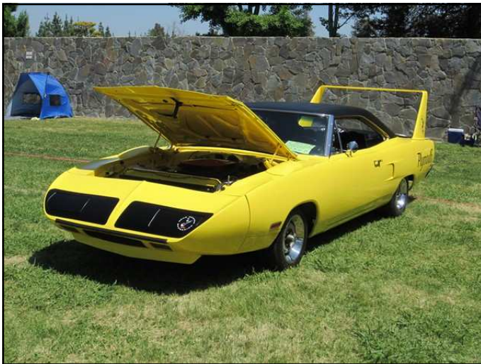
The famous Superbird Charger. When was the last time you saw 1 on the open road?