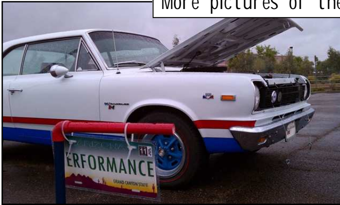
Mark Fletcher's "B" scheme 1969 SC/Rambler