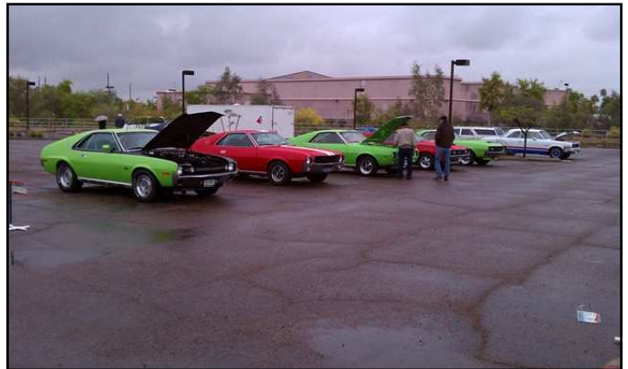
Arranging the cars in green, red, green, red, green colors gave us something to do early while it sprinkled.