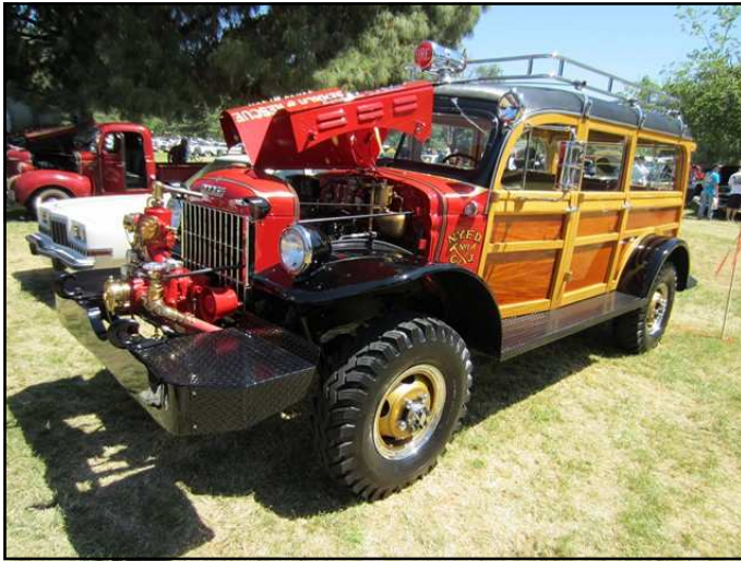
An early version Fire Truck from New York City. Is it a Woodie?