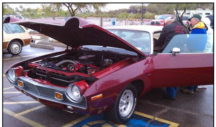
Matador modification madness—A good thing.