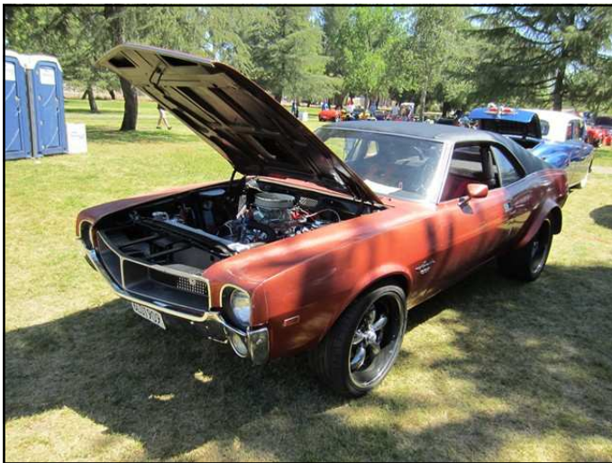
My apologies, I did not get the name of this Javelin owner.