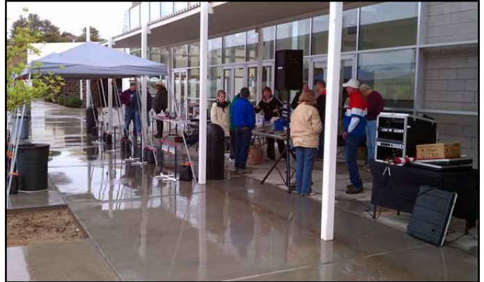
The Cactus Cruisers management used the church's overhang to stay out of the wet weather.