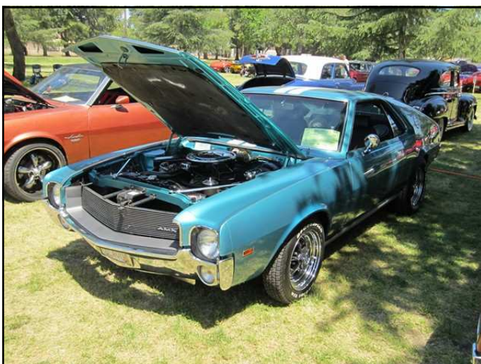
Hobie Kaptan's rad 1969 AMX in the beautiful "Alamosa Aqua" color.