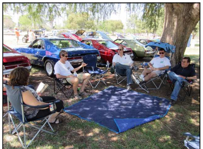
The SoCalAMX crew enjoying the cool afternoon breeze before the awards.