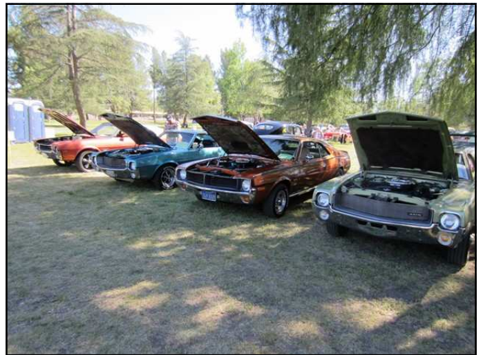
Looking towards the north end of the line of AMC cars at Spring Fling 2011.