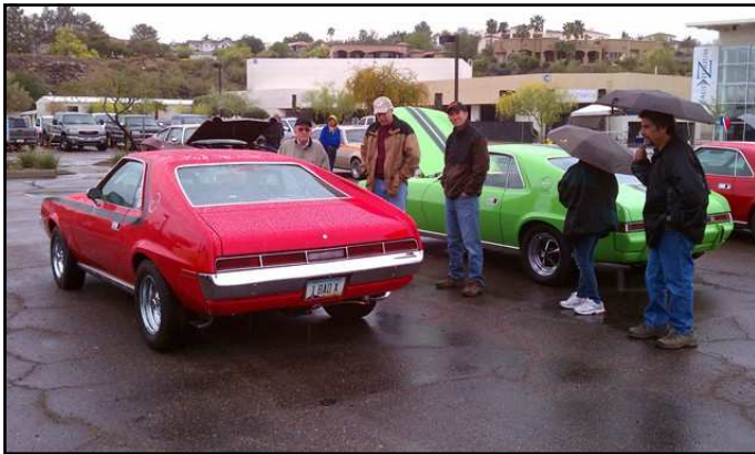
This "1 Bad X" AMX is getting looked over hard.