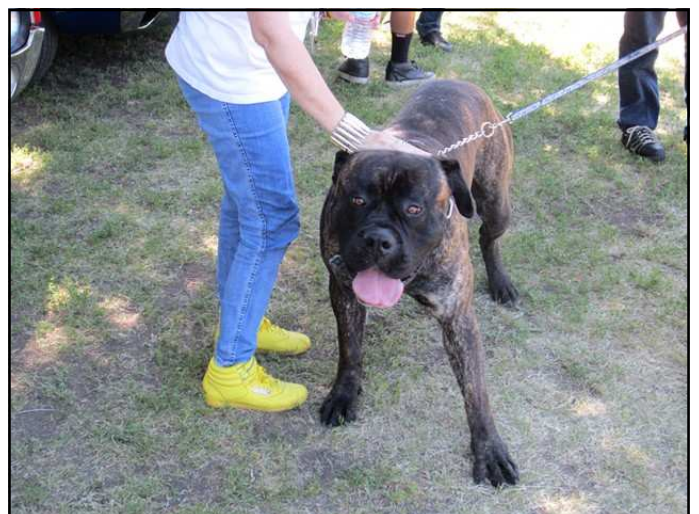
The show is going to the dogs. This one is a whopper! Try picking him up!