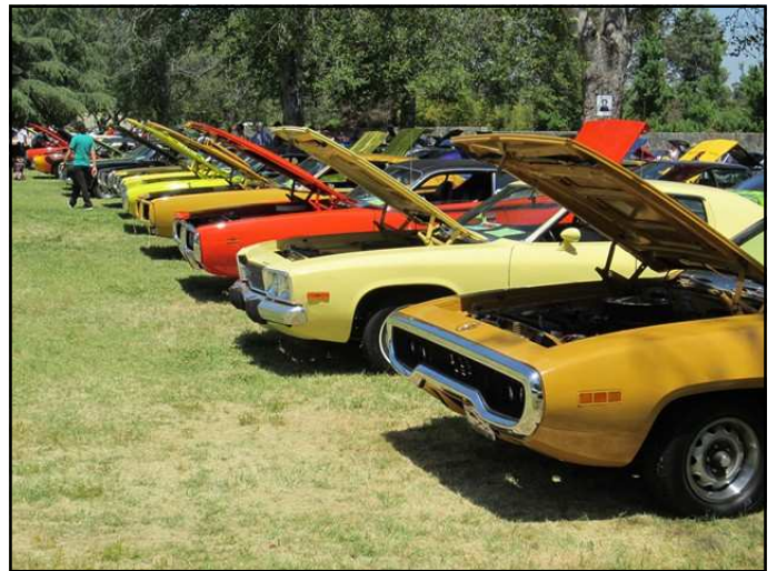
A outstanding afternoon to show off Dodge's finest automobiles.