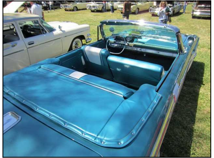
This might be considered a boat looking at the length of the car. Beautiful for sure!