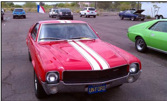
3rd year in a row for "UNFORD" to make the trip.