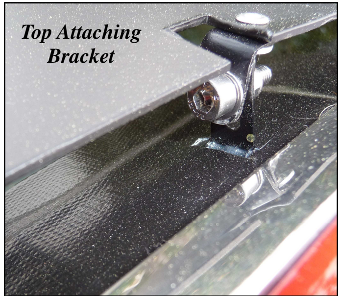
Top Attaching Bracket