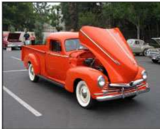
2009 Best Of Show & Best Paint—1946 Hudson Pickup—Lance Baroldi