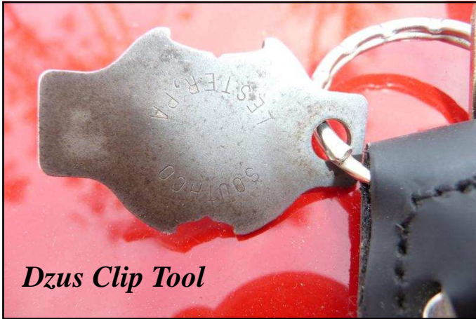
Dzus Clip Tool

attached to the louvers as an assembly—hold them temporarily in the desired location. I used small pieces of gorilla tape again so