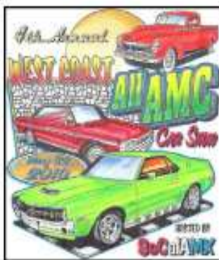
The 2010 Car Show T-Shirt Design

Complete Information at: socialamxcarshow.info