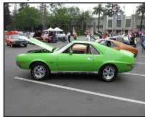
2009 1st Place AMX—1970 AMX—Randy Kirby