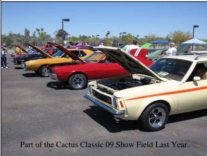
Part of the Cactus Classic 09 Show Field Last Year.